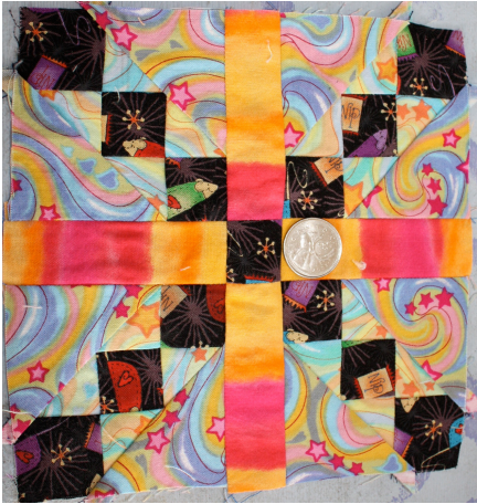
Buffalo Ridge 7" Block