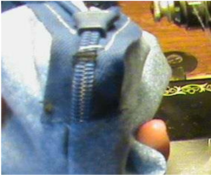
Purse with finished Zipper

I like to tack the ends of the cut off zipper to the purse to help keep it from fraying. You can sew along the whole end with a whip stitch to give it more support to prevent fraying if you like too. I didn't do that here but I sometimes do use the whip stitch. Just gives your zipper a little more longevity. It helps to keep the teeth from separating over time.