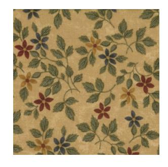
sender mums S_{---}S E_{--}

(Unscramble the letters to find the name of the fabric line.) (Find the answers at requilts.com/store under Featured)