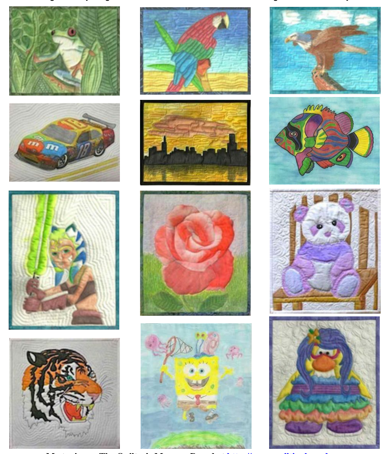
My topics on The Quilter's Message Board at http://www.quiltingboard.com

Derwent Inktense Pencils on Fabric Tutorial (without websites which is required by site rules) <a href="http://www.quiltingboard.com/t-140660-1.htm">http://www.quiltingboard.com/t-140660-1.htm</a>