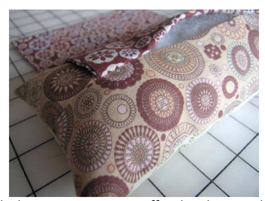
Use the bottom opening to stuff with Polyester Fiberfill, paying special attention to the four corners. The trick is to use as much fiberfill as you can while still leaving space for the Weight Bag.

The photo above shows my Pincushion after being filled with Fiberfill, but before the insertion of the Weight Bag.