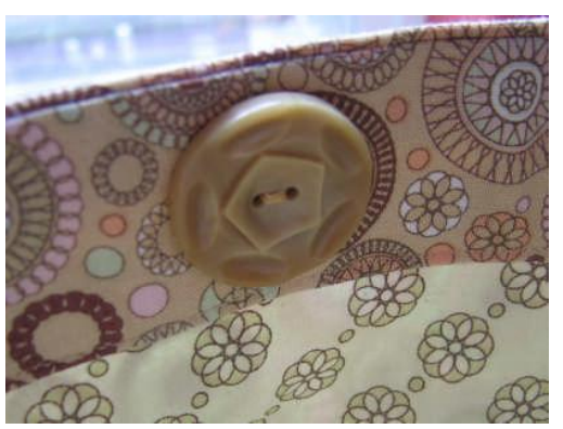
Turn Facing to the inside and press. Stitch Facing near the bottom edge, securing it to bag. Center and sew your button to the Facing, as shown.