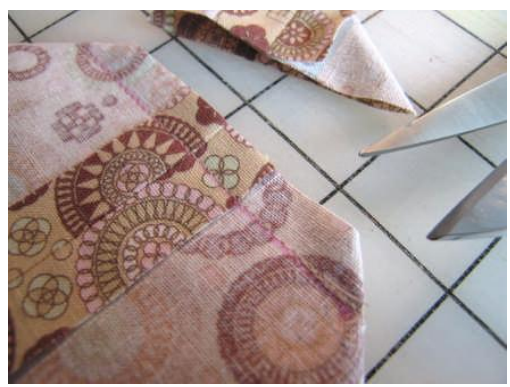
Stitch along the line you've drawn and trim corner, as shown above. Repeat with the other bottom corner of Scrap Bag Exterior and the two bottom corners of Scrap Bag Lining.