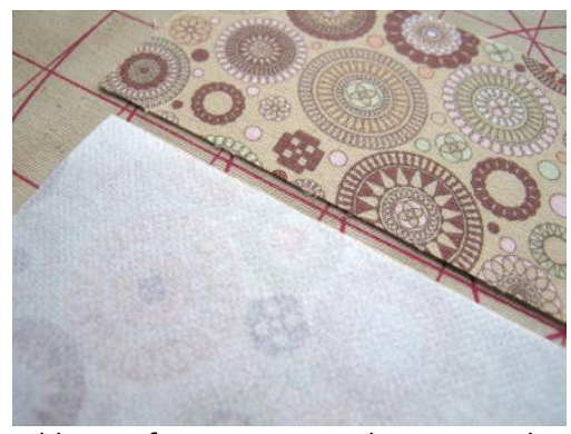
Iron Fusible Interfacing pieces to the wrong side of both Scrap Bag Facing pieces. Placing right sides together, sew the newly interfaced Facing pieces together along the short ends, using a ½" seam allowance and creating a closed loop.