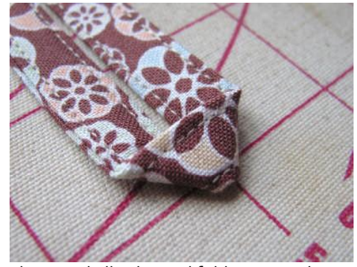
Topstitch around all sides and fold Loop as shown above. Stitch in place across the long side of the folded triangle.