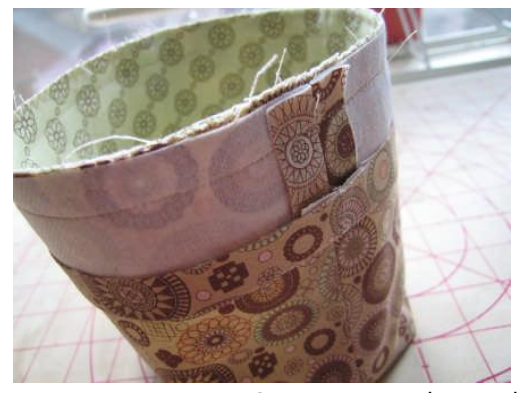
Fit Scrap Bag Facing onto Scrap Bag, as shown above, matching raw edges around the top of the bag. Line up side seams, pin in place, and sew together using a ½" seam allowance.