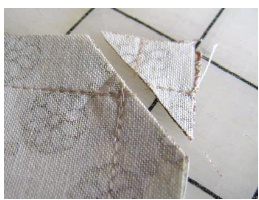
Use a 1/2" seam allowance to sew all four sides closed.

For maximum accuracy, sew the entire length of each side and backstitch at each end, rather than pivoting your needle at each corner. Trim corners, taking care not to clip seams.