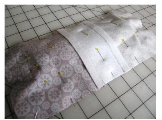
Keeping right sides together, arrange Pincushion Top on top of Pincushion Bottom and pin in place