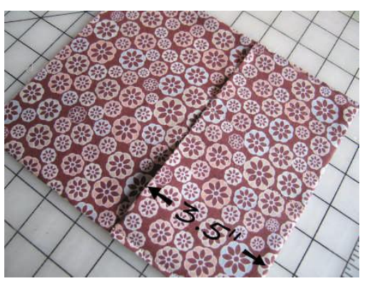
Bring the bottom (folded) edge up 3 ½" inches, creating a small pocket. Stitch both sides in place, keeping stitches close to the edge (about 1/8").