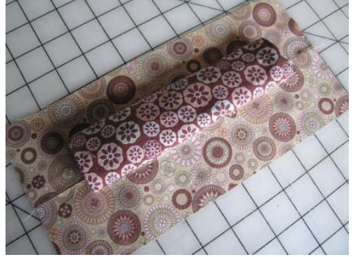
Turn Pincushion Bottom over and roll Pocket Panel as shown to keep it out of the way for the next step.