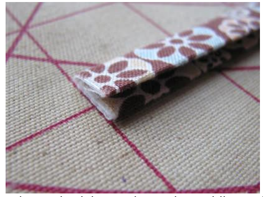
Fold and press both long sides to the middle, as shown above.