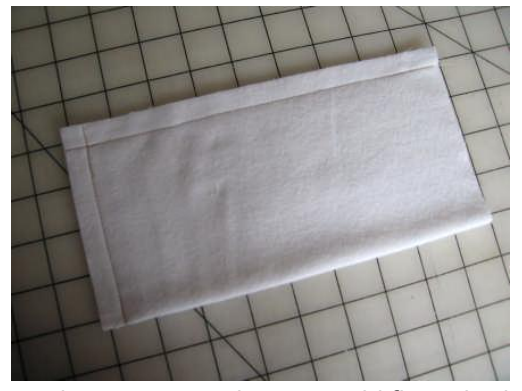
Start by making your Weight Bag. Fold flannel in half and sew two sides closed using a ½" seam allowance, as shown above.