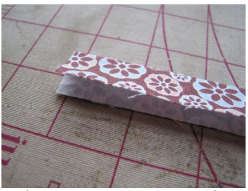
Iron interfacing onto your Loop piece and fold in half, keeping wrong sides together, as shown above.