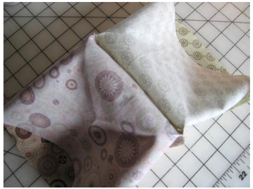
You should now have two bag-shaped pieces. Place them with bottoms together, as shown, and baste or zigzag stitch together the corner seam allowances. (This will hold lining in place.)