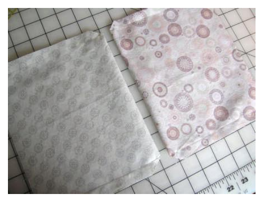
Keeping right sides together, fold your Scrap Bag Exterior in half, matching short ends. Use a 1/2" seam allowance to close both sides. Repeat with Scrap Bag Lining, but using a 5/8" seam allowance.