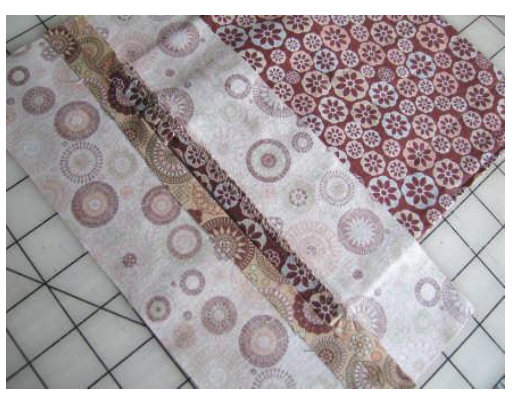
Press seam open, as shown above. (The opening in the middle will be used for stuffing and turning.)