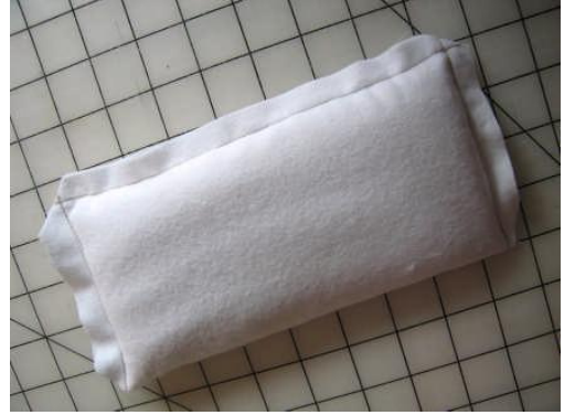
Clip corners, being careful not to clip any seams. Your finished Weight Bag should be floppy, like a bean bag. Set aside.