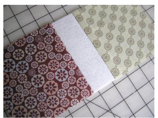
Using a ½" seam allowance, sew your two Pincushion Top squares to either side of your wool felt piece. Press each square to the outside (keeping the felt flat). Set aside.