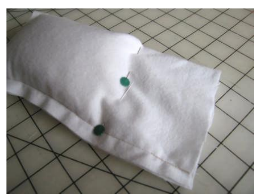
The rice should not fill the entire Bag. Use pins to hold back the rice so you can sew closed the open end, again using a ½" seam allowance.