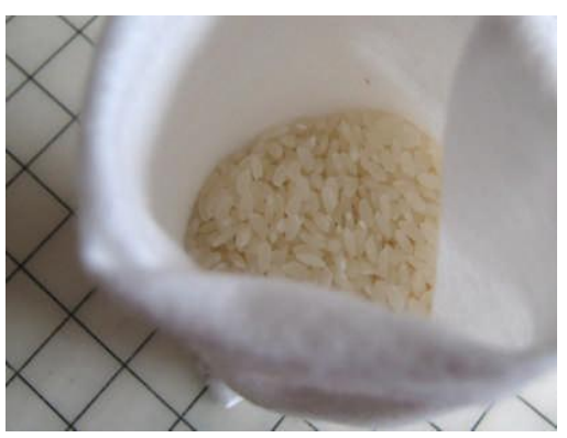
Fill bag with about 1 1/4 Cups of uncooked rice. (You may want to do this in a plastic tub or sink to catch any spillage.)