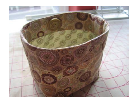
The Scrap Bag can be used on it's own or hung from the loop on the Pocket Panel, using the button.