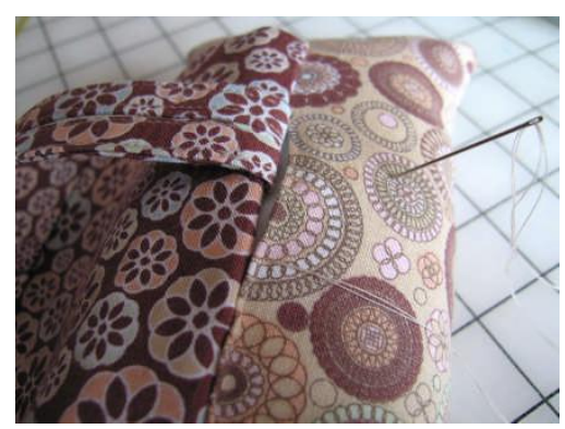
Once you're happy with the shape of your Pincushion, hand sew the opening closed, taking care to keep the loose end of the Pocket Panel from getting caught in your stitches.

This opening will always be hidden, so your stitches don't need to be pretty – just secure!