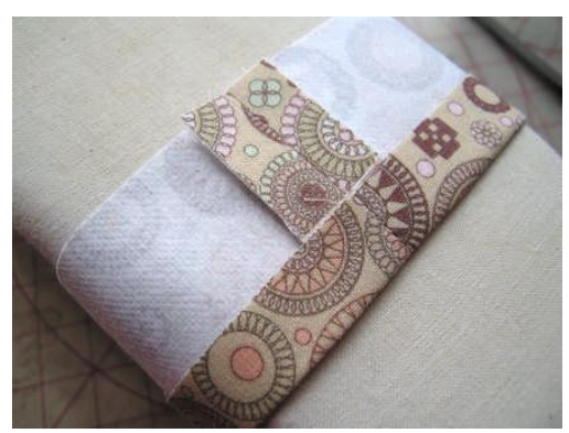
Press seam allowances open. Turn up the bottom of the Facing pieces by about \frac{1}{2} ", as shown above, and press.