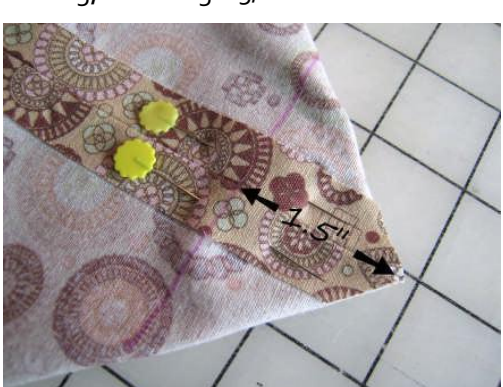
Open up one bottom corner of Scrap Bag Exterior to a point, as shown above. Measure 1 ½" from the point and use a disappearing ink marker to draw a stitching line perpendicular to the seam, as shown above.