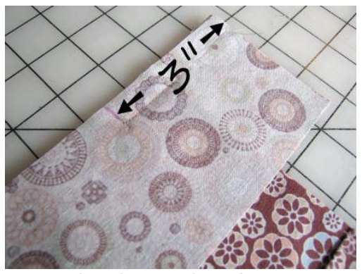
Keeping right sides together, place your second Pincushion Bottom piece directly on top of the first. Using a ½" seam allowance, sew 3" in from each side, backstitching to secure.

Zigzag stitch all layers together along the top edge to cut down on fraying during the next few steps.