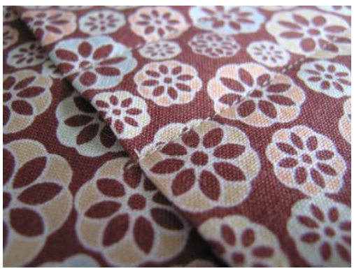
Stitch pocket dividers as desired, backstitching at the beginning and end of each row of stitching to secure.