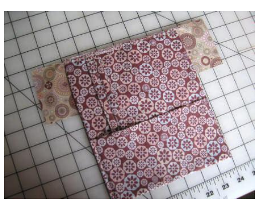
Lay one of your Pincushion Bottom pieces on your work surface and center your Pocket Panel on top, as shown above. Sew in place, keeping your stitching about ½" from the top.

Zigzag stitch all layers together along the top edge to cut down on fraying during the next few steps.