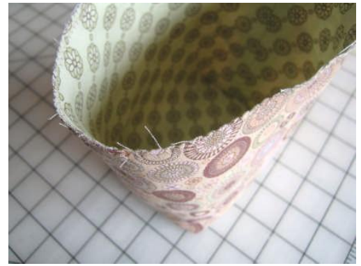
Turn so the Exterior is on the outside and the Lining is on the inside. Baste or zigzag stitch together the raw edges around the top of the bag.