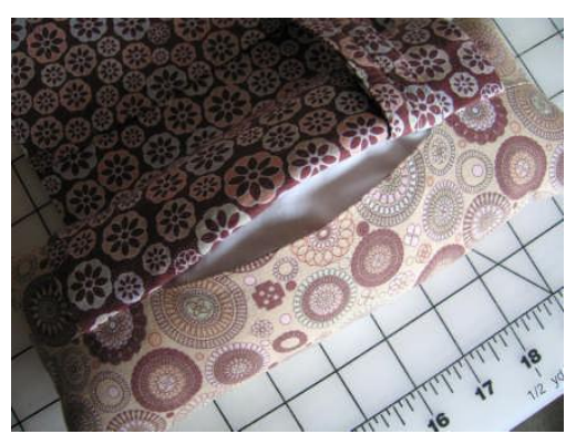
You may need to do a little massaging to get your stuffing and Weight Bag just right.