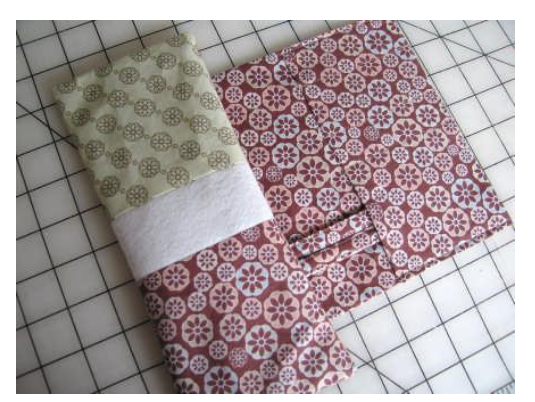
Turn your project right-side-out. It should now look something like the photo above.

For maximum accuracy, sew the entire length of each side and backstitch at each end, rather than pivoting your needle at each corner. Trim corners, taking care not to clip seams.