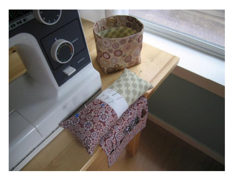
That's all there is to it. Enjoy your new Pincushion!

This opening will always be hidden, so your stitches don't need to be pretty – just secure!