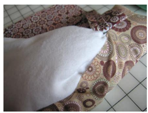
This is probably the trickiest step! Carefully feed the Weight Bag into the Pincushion, shifting the rice in the bag as needed until the whole thing fits inside the pincushion.

The photo above shows my Pincushion after being filled with Fiberfill, but before the insertion of the Weight Bag.