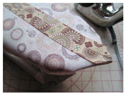
Clip bottom corners (near the fold) of Scrap Bag Exterior and press side seams open. Repeat with Lining.