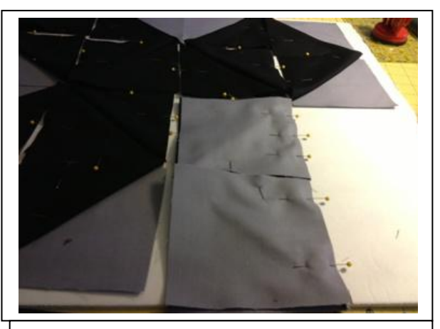
Begin joining the blocks with the triangles inside.