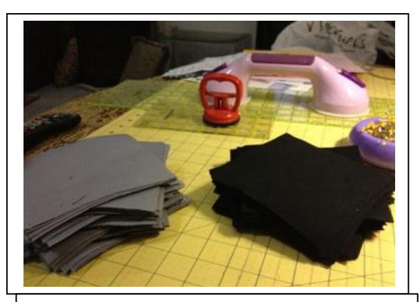
You will need a lot of squares. I'm using 5" squares for my quilt.

Then pin down the triangles so you can start piecing the blocks together.