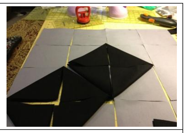
Now fold the squares to form triangles and place on the background. They will form the window where the colored fabric piece will go.