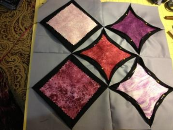
To complete the cathedral window, pull the black fabric inward to form the leading around each section of the cathedral window.