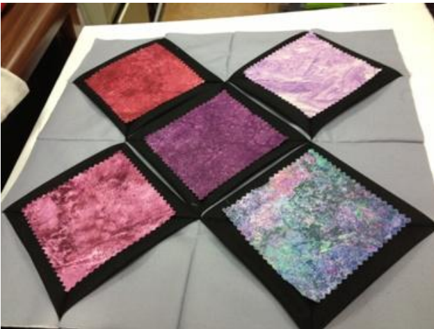
Set the insides of the window in place. They are the same as the squares I started with. In this case, they are 5" squares.