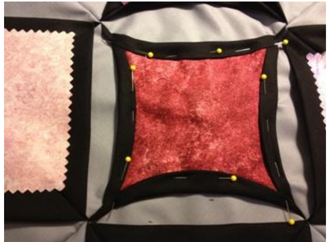
Now form the cathedral window by pulling the fabric inward.