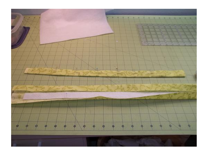
11-Find center of long side & place straps on each side with 6" between

12-Cut the corners 1 ½ inches in from corner.