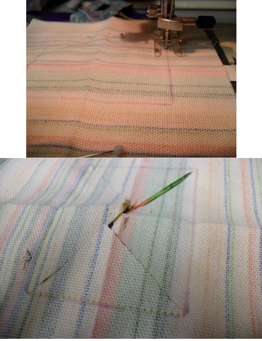
Cut in the center of the rectangle and cut to the points as shown.

Place the other matching piece, right sides together. Sew along the line you have just drawn.