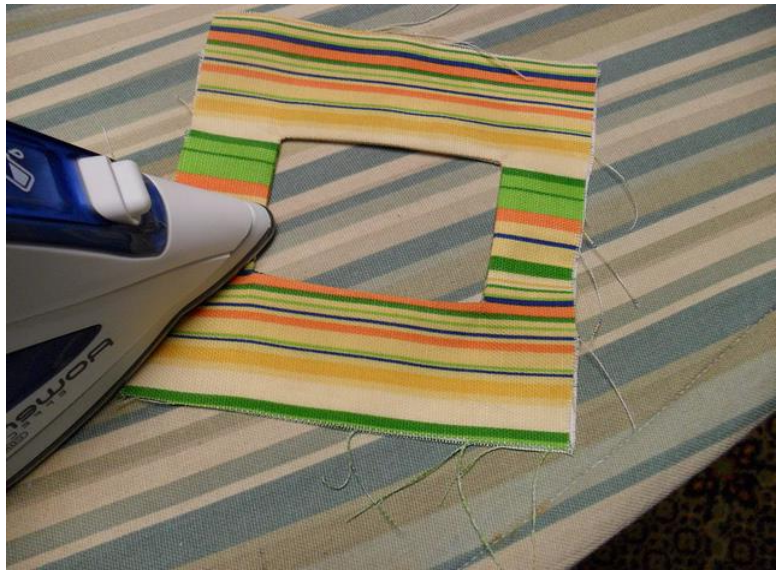
Push one side through the hole to the other side so that wrong sides are together. Press.