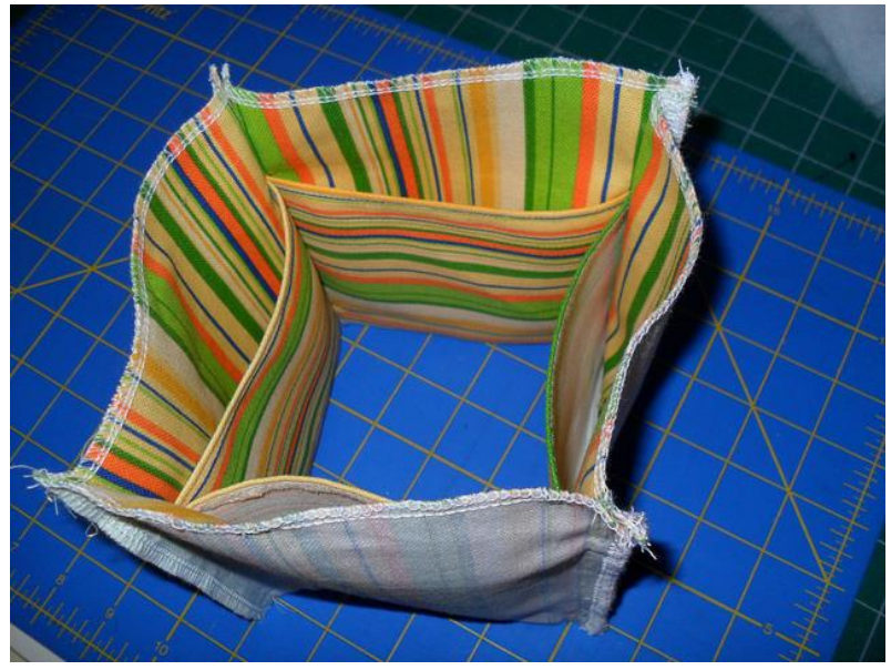
Keep sewing the 4 pieces right sides together until you have a box shape as shown.

To sew the sides together, mark each side piece at the 1/2'' from the top as shown. That is your starting point to stitch. Stitch using a 1/2'' seam allowance and stitch to bottom taking care to match the tops of the pockets together. I put a pin at the top of the pockets to keep them in place.