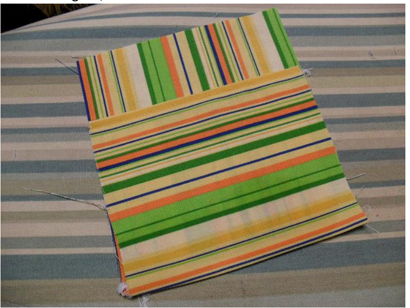
Flip pocket around to front and press.

For the sides, lay your side piece (mine was 5-1/2'' \ge 6-1/2'' face down. Place the top stitched pocket piece (mine was 5-1/2'' \ge 5'' ) right side down as shown. Stitch along the bottom. Again, you may serge or stitch using your sewing machine using a 1/2'' seam allowance. Do this for all 4 sides.