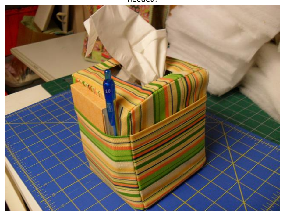
That is it. You are done. Quick, simple and oh so easy. If you have any questions, let me know.

Starting with one side, pin the right side of the side to the right side of the top (that would be the side without the markings) together. Drop your needle in the center of the x and continue sewing till you reach the center of the other x. Drop your needle in the x, lift your machine foot and rotate your fabric to sew down another side. Before continuing to sew, place another pin at the new second x spot. Continue doing this until the top is sewn on. Turn right side out. Press if needed.