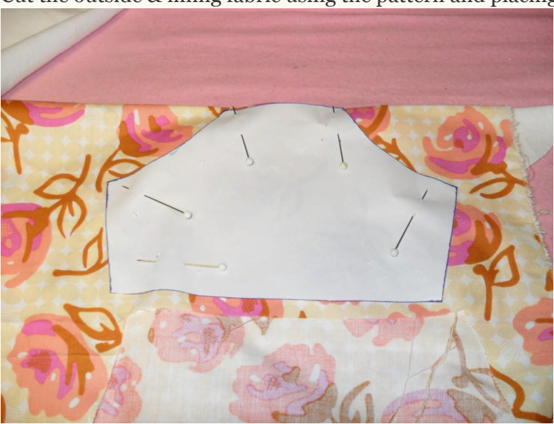
Lay the outside fabric on top of the fleece and using it as your pattern, cut out the fleece. If using fusible, iron it to the fabric.

Cut the outside & lining fabric using the pattern and placing on the fold.