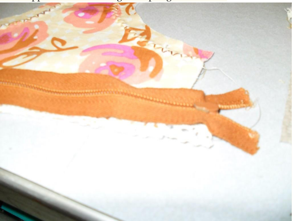
Place lining fabric on top of the zipper. The zipper will be sandwiched in between.