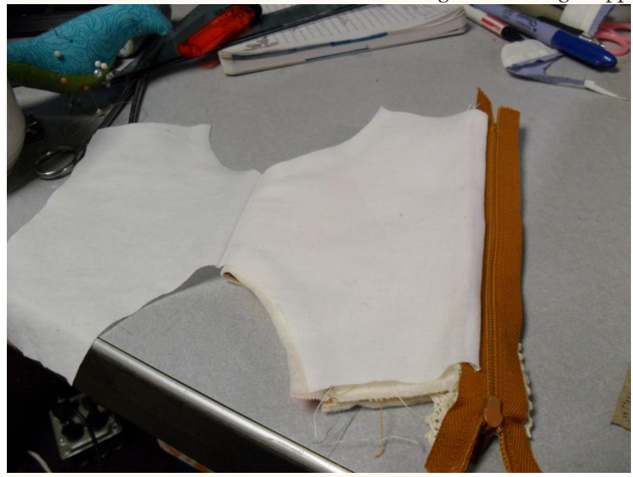
Now it will look like this isn't correct, but it is.

Flip over the purse and fold up the lining to the other side of the zipper. The zipper needs to be sandwiched in between the fabric and the lining. Stitch using a zipper foot.