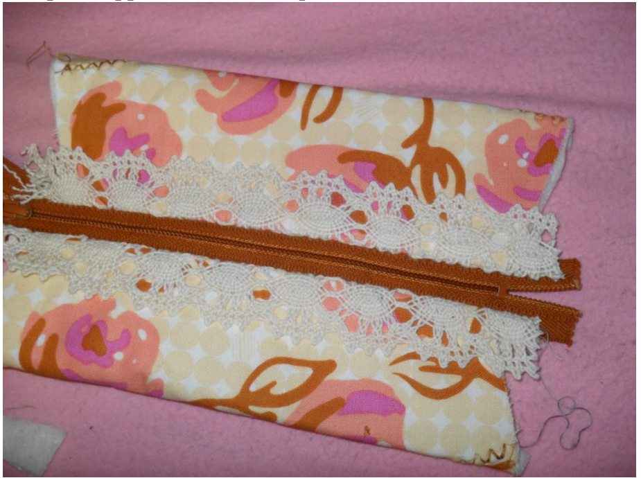
Now grab both lining pieces and pull out. Do the same with the outer fabric. The lining pieces need stitched together as do the outside pieces need stitched together.