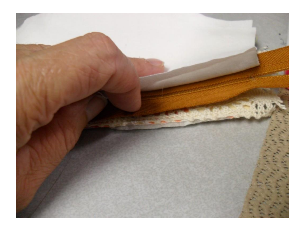
Unzip the zipper a little bit and pull the inside out. See. It works. Press well on both sides of the zipper.