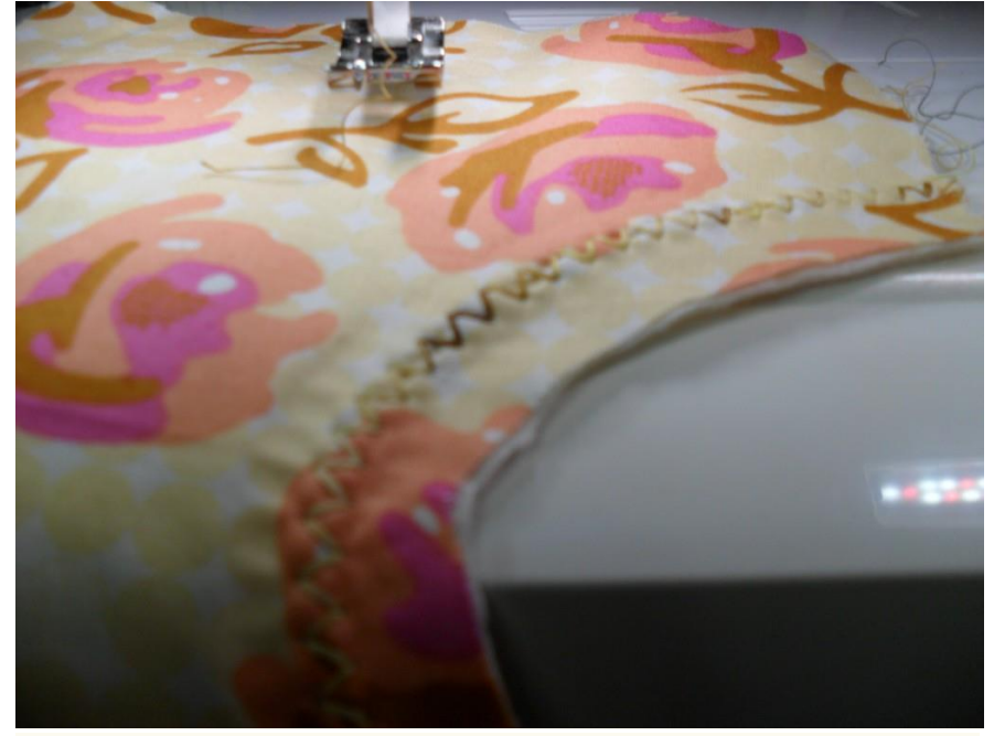
Sew on the lace at the top of both sides. Use a very narrow stitch.

Stitch the legs of the panties first. This is a good place to use some of those decorative stitches that don't get much use. I tried several but seemed to fall in love with a simple triple zig zag stitch. Sew both leg opening with the stitch of choice. Stitch using the 5/8" seam allowance marked on the sewing machine.