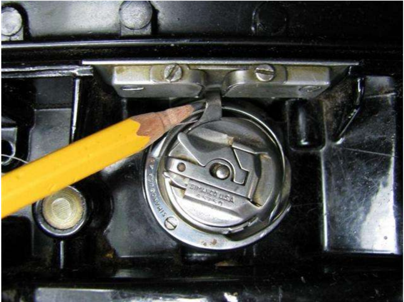
Bobbin Case positioning finger between Bobbin Case Position Plate Springs

One annoying problem with the Featherweight is the clicking sound that sometimes occurs when sewing. If the noise comes from the bobbin area of the machine, and you have already confirmed that the needle is installed correctly – flat goes to the left and the feed dogs are not hitting the needle plate, another likely place to look is the Rotating Hook Bobbin Case Position Plate Springs. I know, that is a really long name for a small part but this is the name given by Singer. Basically on the bottom of the needle plate is another plate held on by two screws, which holds two flat springs. These springs, over time, can become compressed and lose the tension that they originally had against the Bobbin Case Base positioning finger. These springs act to dampen the movement of the Bobbin Case Base and still allow the thread to pass through. If the springs have lost their tension, there will be an audible clicking sound when the Bobbin Case Base positioning finger is able to move too far and hits the spring instead of being gently held by the spring.