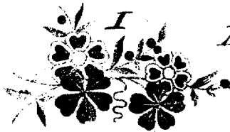
Fig 11 c