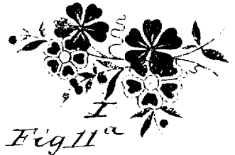
Fig 11 a