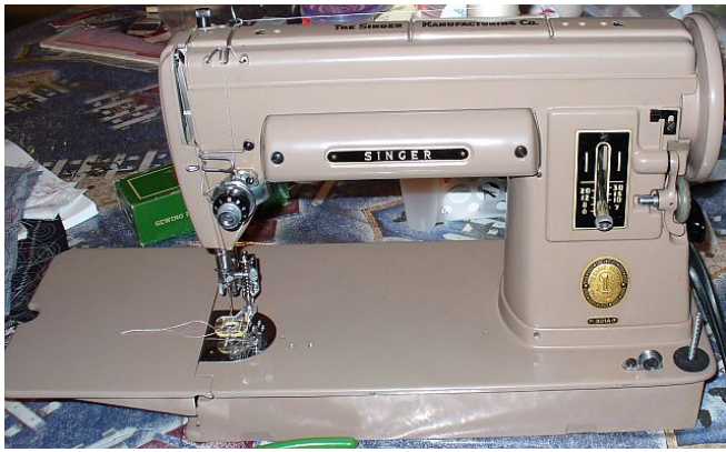
301 long bed - uses same bobbins as the 221

feed dogs raise and lower on these two machines