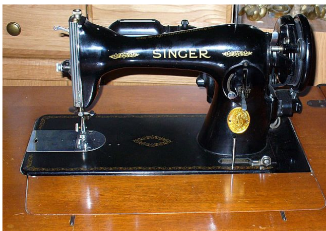
15-90 this machine has a thumbscrew underneath that raises and lowers the feed dogs - great for free motion quilting. A real work horse but NOT "industrial strength" no matter what some seller on Ebay says.