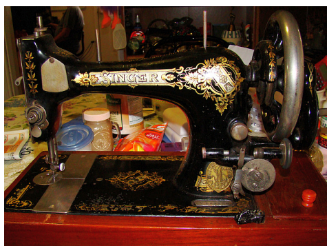
hand crank 28