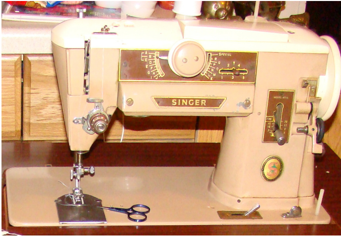
401 - has a 'cam stack' makes numerous decorative stitches without having to have extra discs.