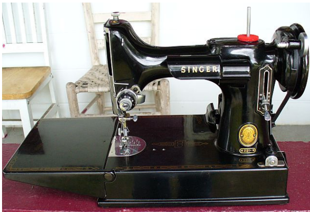
Featherweight - 221 Notice the bed to the left of the needle raises just as it does on the 301s but the 221 is a SMALL MACHINE and very lightweight - hence the designation of "Featherweight" Do not think that just because you found an old black Singer that you scored a Featherweight. This machine is SMALLER than the 28/99/185 and MUCH lighter.